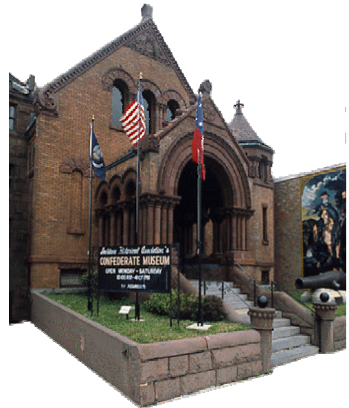
Confederate Memorial Hall

The museum is in critical financial difficulty. CMH receives no governmental funding and relies solely on visitor admissions and donations for its operating revenue. In a normal year, the museum receives approximately 8,000 visitors from January to June, but Katrina has drastically reduced the resident population of New Orleans, and tourist traffic has been slow to recover. Note that hurricane damage to the