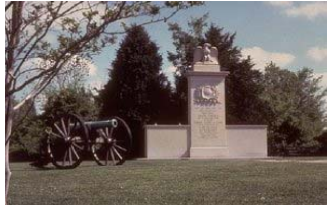
Brice's Crossroads National Battlefield Site

The Battle of Brice's Crossroads, which was fought on June 10, 1864, in Lee County, Mississippi, pitted a 4,787-man force led by Confederate cavalryman Forrest against a 7,900-strong Union force under the direction of Brigadier General Samuel D. Sturgis. The battle ended in a route for Union forces and was the high point of Forrest's military career.