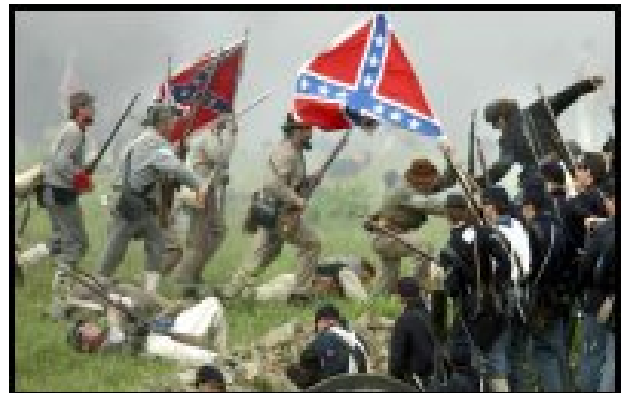
Civil War Re-Enactors in Action

On February 11 Civil War re-enactors gathered for the event in Madisonville, Texas. The occasion was marked by infantry, cannon, and gunnery at Lake Madison Park. The Civil War engagement was deemed the battle for El Camino Real and came to life within just feet of an excited crowd. And though there was not actually a battle of El Camino Real in the Civil War, the re-enactors of this event prided themselves on providing a “period-correct” battle that day, all the way down to the uniforms and munitions of the period.