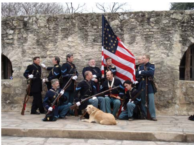
Twiggs’s Surrender Re-Enactors

The ever-fascinating aspect of this relatively minor confrontation is that had General Twiggs resisted, the “shootin’ phase” of the war would have begun two months earlier than it actually did. In that case, we would all have had yet another reason to “Remember the Alamo!” Twiggs’s surrender is commemorated during most years in February at the Alamo.