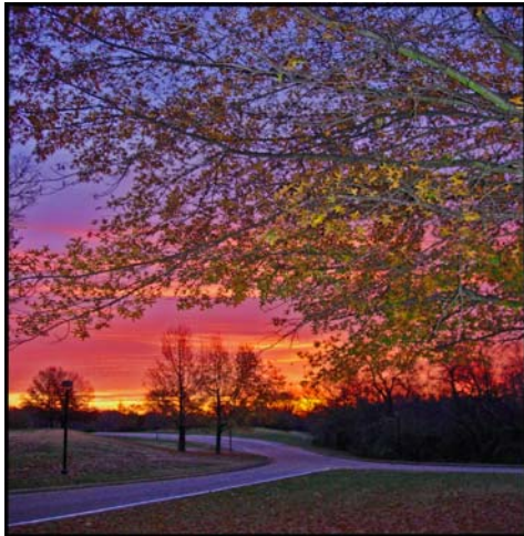
Shiloh Sunrise __Nature's Symphony

Remember, these beautiful scenes are best viewed on the emailed version of our newsletter! We will try to insert more of these photos as time and space permit.