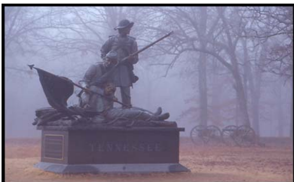
Shiloh's Tennessee Monument at Dawn

Additional photos will follow in subsequent newsletters, so stay tuned.