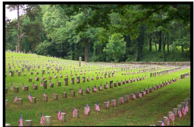
Shiloh Cemetery and Eternal Rest