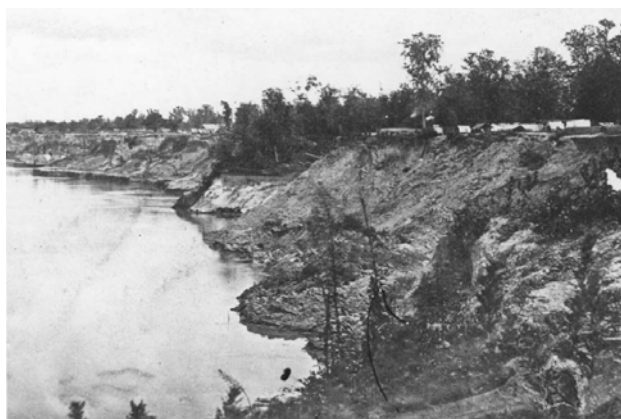
Port Hudson's 80-Foot Protective Bluffs

Local reenactors will be participating in two upcoming events at Port Hudson and Gettysburg. The Port Hudson event is scheduled for March 28-30 and Gettysburg, for July 4-6. There is a possibility that participants will be allowed to relic-hunt for spent ammunition rounds.