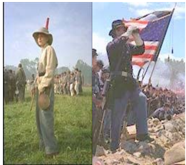
Gettysburg Reenactment Events

The second event, at Gettysburg, will encompass a reenactor march in the streets of the town to recreate the advance of Early's troops into the area in search of supplies. The Mayor and other local gentry as city officials will be participating. It will be the first time since 1863 that an organized "Confederate" army has marched along these same streets. Please see or email me for more information.