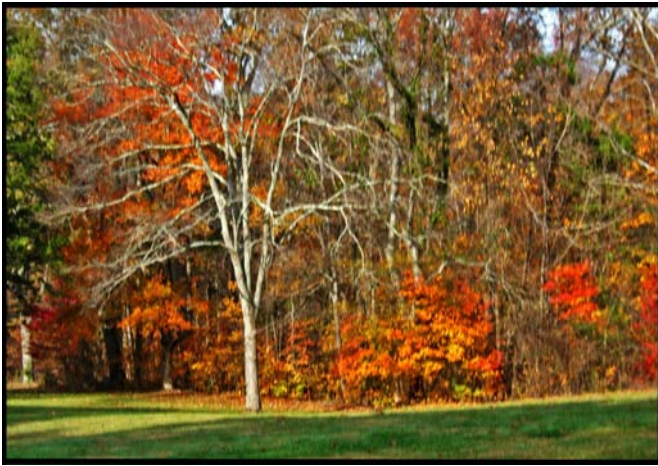
Shiloh in Autumn __A Fall Celebration of Color & Harmony

We are much indebted to Ron for these beautiful photos he is sharing with us. The battle may have been waged in the spring but the scenes and landscapes are most Inspiring when viewed in the fall.