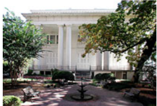
Museum of the Confederacy, Richmond, VA