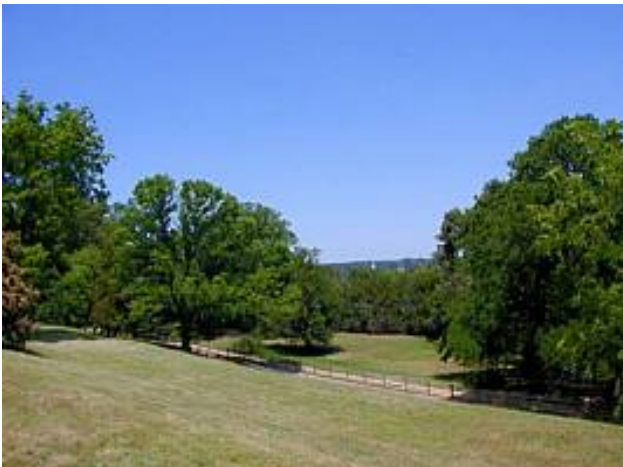
The View from Marye's Heights, Fredericksburg, Ranking Among the Foremost Landmarks in American Military History

This should be a great trip, and we hope as many of you who can will join us. I am currently accepting deposits of $250 per person. More details will be forthcoming in future editions of General Orders , so stay tuned!