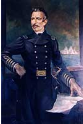
Captain Raphael Semmes

Maryland-born in 1809, Raphael Semmes was orphaned at an early age and reared by an uncle in the Washington D.C. area. Appointed a midshipman in the U.S. Navy on Apr 1, 1826, Raphael entered into studies at the Naval School in Norfolk, VA and then performed extensive service on the southern coast of the U.S. Commissioned a lieutenant on February 9, 1837, Raphael studied law during frequent shore duty and was admitted to the bar in 1834.