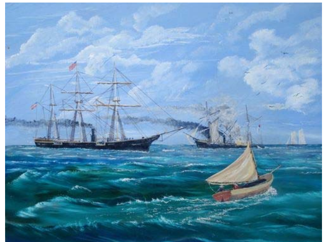
The U.S.S. Kearsarge Challenges the C.S.S. Alabama

Semmes tried to arrange for an overhaul of his vessel in Cherbourg, France, but while awaiting permission to enter the harbor, he was challenged by the Union sloop U.S.S. Kearsarge . The two ships met in battle within sight of land on June 19, 1864. Taking on water, the Alabama sank stern-first some two and one-half hours after the action began.