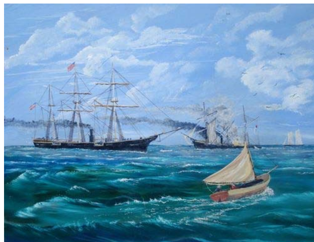
The U.S.S. Kearsarge Challenges the C.S.S. Alabama

Semmes tried to arrange for an overhaul of his vessel in Cherbourg, France, but while awaiting permission to enter the harbor, he was challenged by the Union sloop U.S.S. Kearsarge . The two ships met in battle within sight of land on June 19, 1864. Taking on water, the Alabama sank stern-first some two and one-half hours after the action began.