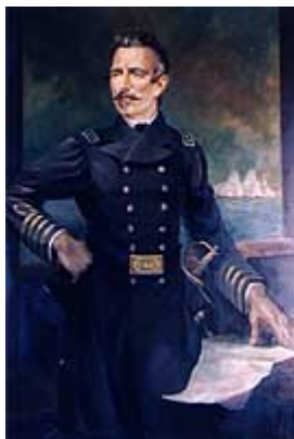
Captain Raphael Semmes

Maryland-born in 1809, Raphael Semmes was orphaned at an early age and reared by an uncle in the Washington D.C. area. Appointed a midshipman in the U.S. Navy on Apr 1, 1826, Raphael entered into studies at the Naval School in Norfolk, VA and then performed extensive service on the southern coast of the U.S. Commissioned a lieutenant on February 9, 1837, Raphael studied law during frequent shore duty and was admitted to the bar in 1834.