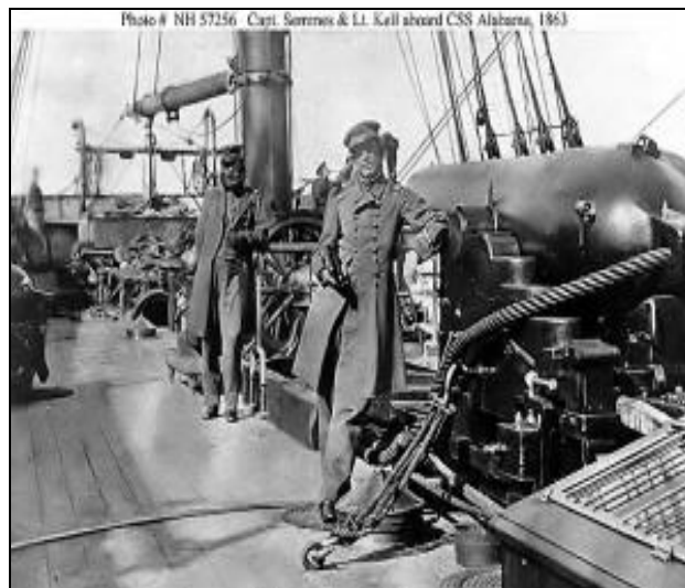
Raphael Semmes on the C.S.S. Alabama