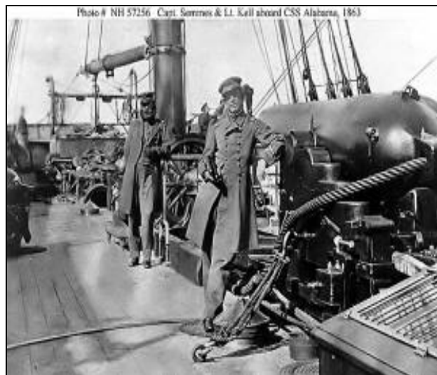
Raphael Semmes on the C.S.S. Alabama