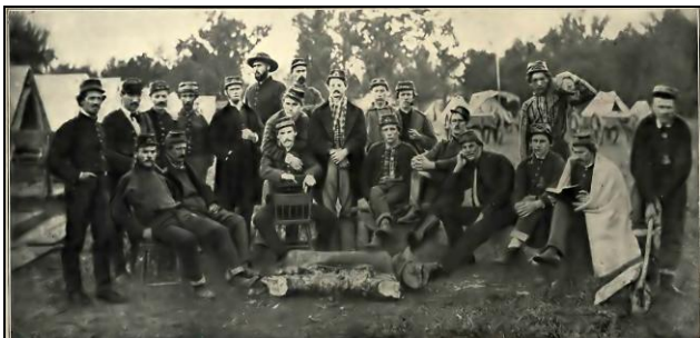
Washington Artillery, Shiloh, 1862