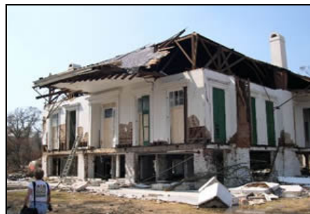
Beauvoir, immediately post-Katrina

The continuing work on Beauvoir is indeed a labor of love to everyone involved in this monumental effort to restore the home and grounds to their appearance when Jefferson Davis lived there from 1877 – until the time of his death in 1889.