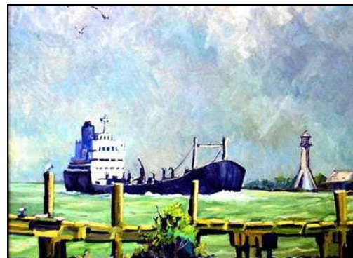
Oil Painting Inclusive of the Sabine Pass Lighthouse, Port Arthur's Museum of the Gulf Coast

The lighthouse can be seen at a distance from Sabine Pass Battleground State Historic Park at Sabine Pass, Texas. During its life span of approximately a century and a half, the landmark has survived Civil War battles, innumerable storms, hurricanes and floods, a marsh fire, vandalism, and long periods of neglect.