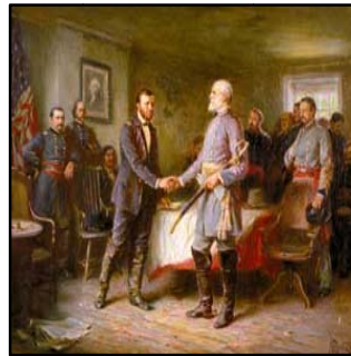
Lee & Grant at Appomattox

The conventional view of the war's outcome is summed up by the first line of Robert E. Lee's General Order No. 9 , issued after the surrender at Appomattox: "...the Army of Northern Virginia has been compelled to yield to overwhelming numbers and resources." Grant, it was said, "butchered" his way to victory on a tide of men and materiel . The implication is that the defeat of the South was inevitable.