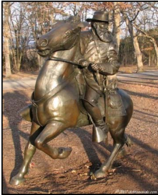
James Longstreet Memorial

You may contact me with questions or concerns at 15811 Spruce River Ct, Sugar Land, TX 77498. My email address is