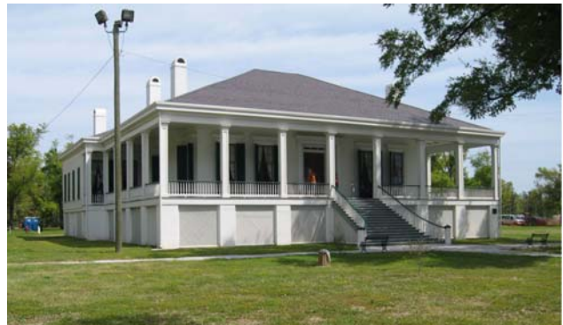
Beauvoir – April 2010