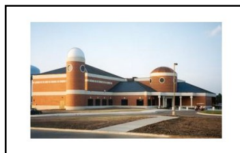
Navarro College in Corsicana

In May I received a call from Navarro College in Corsicana. The Museum and College are