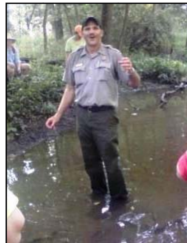
Recreating History Where it Happened

often happens in cursory lookbacks at history. His presentation will strip away those blinders and explain the battle in its logical connectedness.