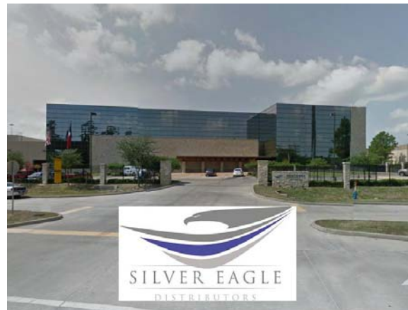
Silver Eagle Distributors - 7777 Washington Ave.