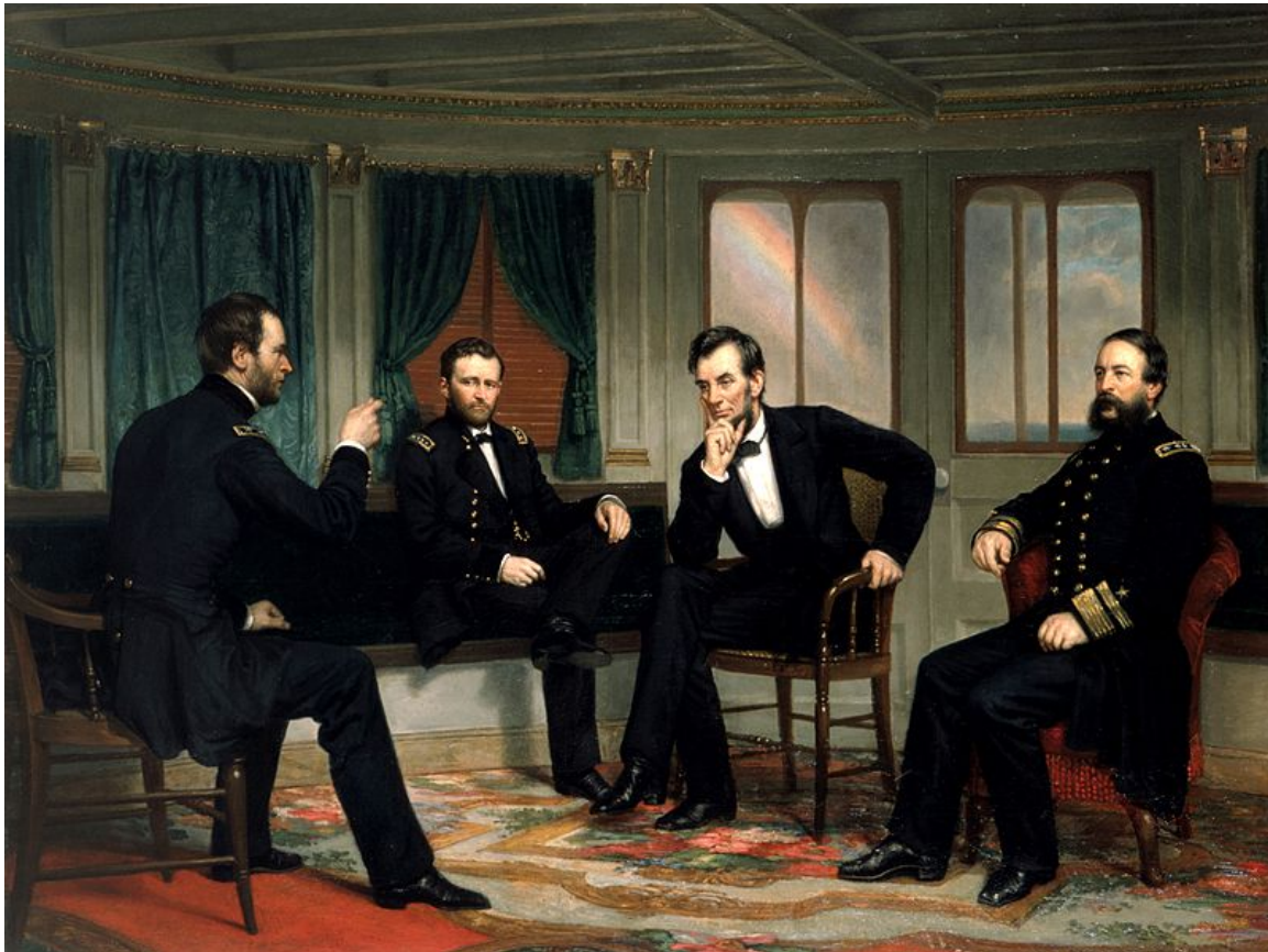
The Peacemakers - George P.A. Healy