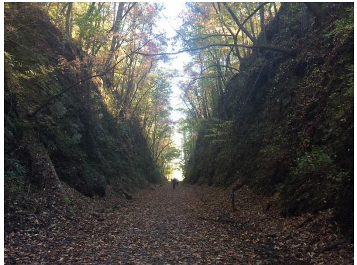
The Civil War Railroad “bed”, Allatoona, GA

Peachtree Creek. We also had a brief tour of the Civil War section of the Atlanta History Center before catching our return flights. If you had gone with us, you would now understand the term “Shoupade”. Besides wonderful interpretations of Civil War history, we also enjoyed the beautiful north Georgia scenery, barbeque, and other fine cuisine.