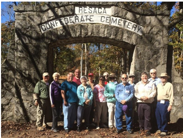
Chandler’s Texas Brigade at The Confederate Cemetery, Resaca, GA