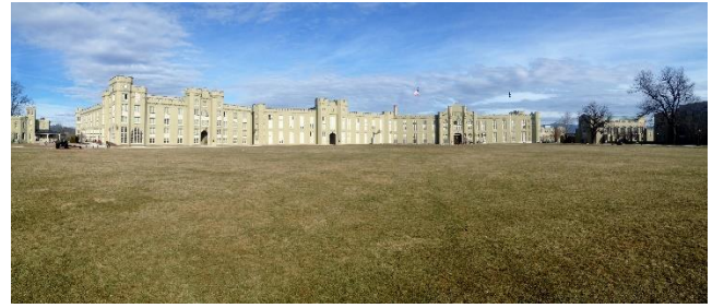
Virginia Military Institute

Members are encouraged to donate some of your well-read books or a small monetary donation for purchase of books to continue a valuable support to the HCWRT Raffle. Your contributions will help fund the operation of our Round Table and enable us to continue bringing quality speakers each and every month!