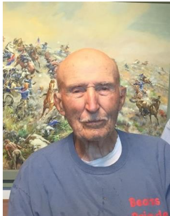
Edwin C. Bearss

division to arrive there. Sturgis sent in infantry reinforcements and counterattacked the Confederates. Although outnumbered two to one, Forrest used his more mobile cavalry to threaten both ends of the Union infantry line simultaneously and his artillery to focus on the center. When Forrest’s 2 nd Tennessee Cavalry, on a wide flanking move, captured the bridge over Tishomingo Creek in Sturgis’ rear, the Union force fell back. The Confederate cavalrymen pursued the rapidly retreating Federals several miles toward Memphis. Forrest’s brilliant tactical victory against long odds cemented his reputation as one of the foremost mounted infantry leaders of the war.