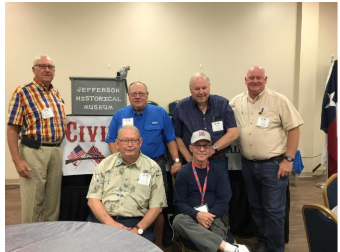
HCWRT members at last month's Jefferson Symposium