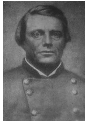
General Thomas Green

Tom Green was an American soldier and lawyer who took part in the Texas Revolution of 1835-36, serving under Sam Houston, who rewarded him with a land grant. Green was clerk of the Texas Supreme Court until the outbreak of the Civil War, when he became a Confederate cavalry leader. After winning several victories, including the Battle of Valverde and the recapture of Galveston, he was promoted to Brigadier General and assigned command of the cavalry division of the Trans-Mississippi Department. Green led his cavalry division to Louisiana to reinforce General Richard Taylor and help stop the advance of Union General Nathaniel Banks toward Shreveport. On April 12, 1864, he was mortally wounded while charging a fleet of Federal gunboats.