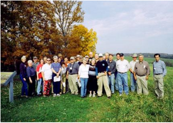
2004 Fall Field Trip