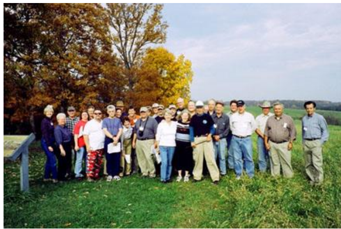
October 2004 HCWRT Field Trip with the late Ed Bearss on Fisher's Hill Battlefield in Virginia near the "Witness Tree"

After an extensive city-wide search of over 30 locations, our board has chosen Rudi's as our home for the 2023-2024 campaign! Rudi's provides a very reasonably priced and excellent selection of food and beverages. Our lecture room is exceptional for seeing and hearing our live Civil War presentations.